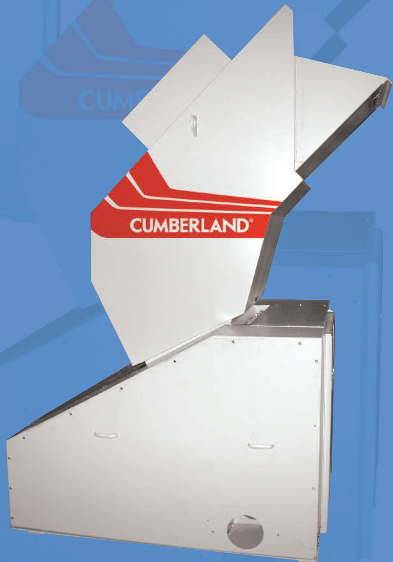
2045TF Series Granulator